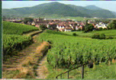
The vineyards of Turckheim.