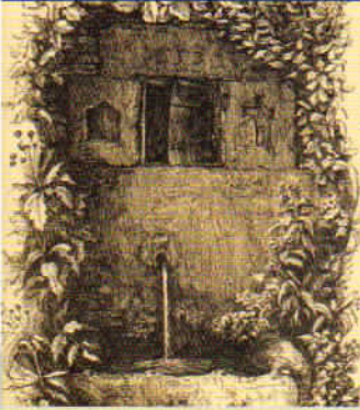
The lost Brunstuf fountain of Roesselstein.