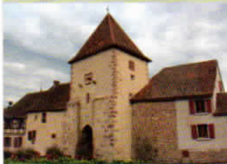
The Brand Gate.

Follow the dragon and pass through the Brand Gate, like the wine-growers of old, to discover the vineyards of Turckheim and its different wine-producing terroirs.