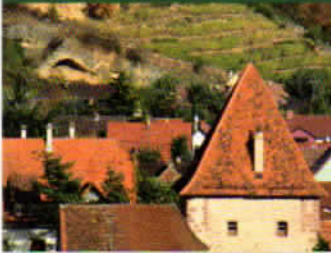
The dragon's cave.