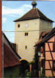
The Munster Gate.