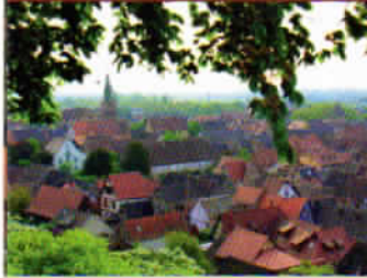
The roofs of Turckheim.